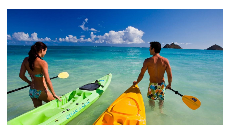
ABOVE: A couple going kayaking in the oceans of Hawaii https://www.visittheusa.com/state/hawaii

The Big Island is best known for Hawaii Volcanoes National Park with its active Kilauea Volcano. When conditions are right you can see the lava from a land viewing site, and the rest of the time there's almost always viewing by helicopter or boat. It is the youngest of the islands and the volcano continues to create new land. This is why the Big Island has so many black sand beaches. Other famous attractions include Mauna Kea, the world's tallest mountain (counting from beneath the sea to its snow-capped peak) with the largest telescopes in the world, a green sand beach, Kona's world-class deep-sea fishing and the famous Kohala resorts.